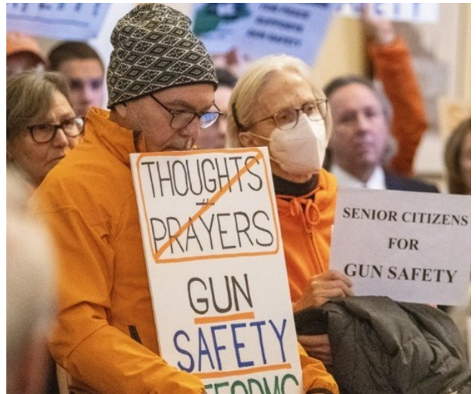
You help bring the progressive, prophetic voice of faith to the State House.

Your support for a coalition of seven mainline Protestant denominations (with 400 local congregations and 50,000 parishioners in Maine) shows you understand the power