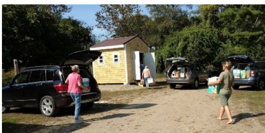
Midcoast Friends Meeting provides storage for the diaper bank.

Midcoast Friends Meeting, Water of Life Lutheran Church, St. Andrew's Episcopal Church, and Second Congregational Church of Newcastle , in partnership with St. Patrick's