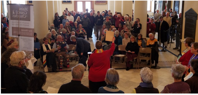
Interfaith Prayer Vigil in the State House Hall of Flags

and First Parish Unitarian Universalist Churches created the candle drawings, which were used as “stationery” by participants at the conclusion of the vigil to write letters to their representatives and senators that MEJP staff hand-delivered.