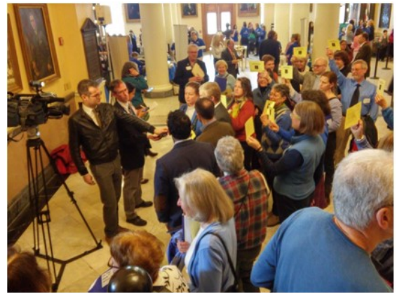
Faithful advocates flash their “I support A Moral Budget” cards for the cameras .

“It is so helpful to focus on living our faith rather than winning or losing a debate or election. It helps keep me focused and not get discouraged.” – Interfaith Advocacy Days Participant