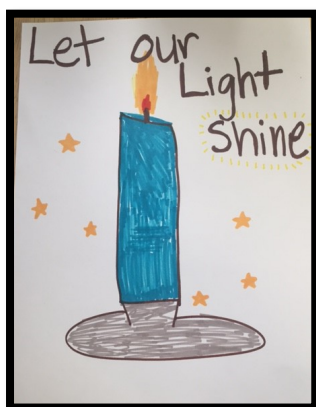
Paper candles shine at prayer vigil at the Statehouse.