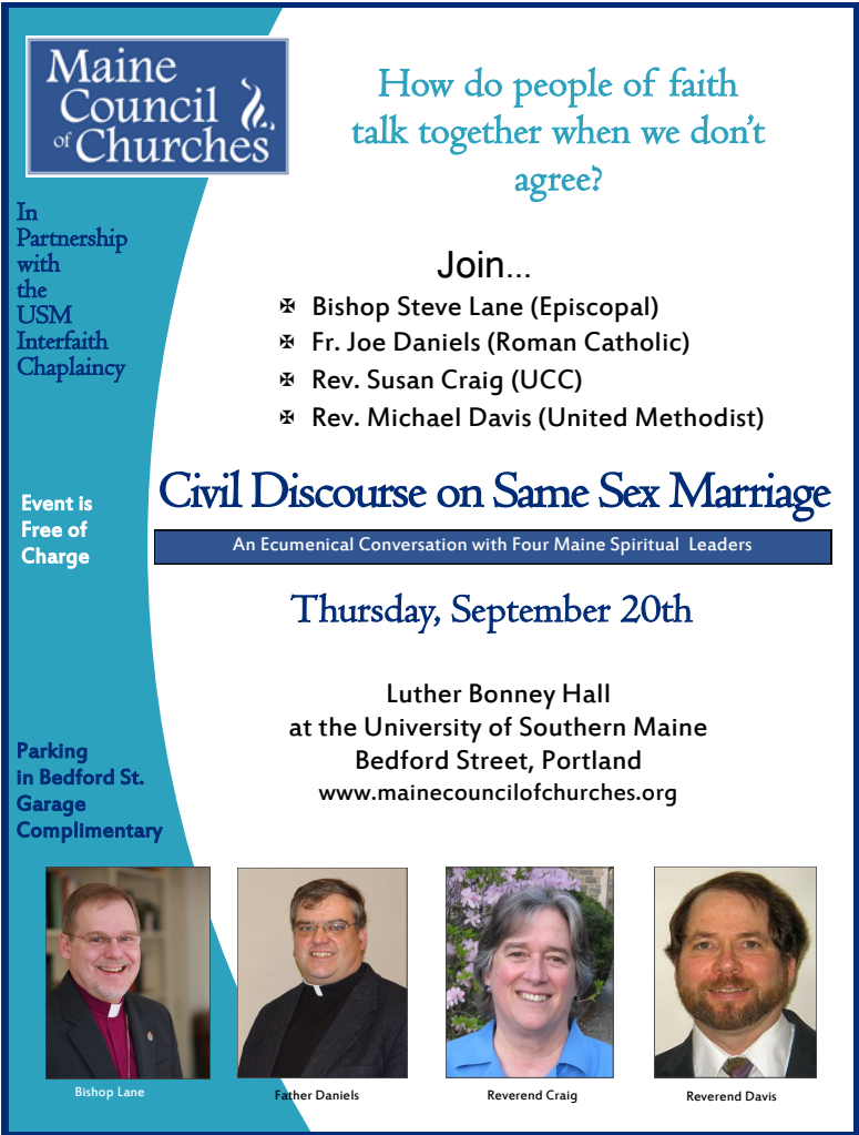
Sample promotional poster from the 2012 Civil Discourse event.

To download a copy of the Covenant, or to view a list of candidates who have signed the Covenant, please visit the